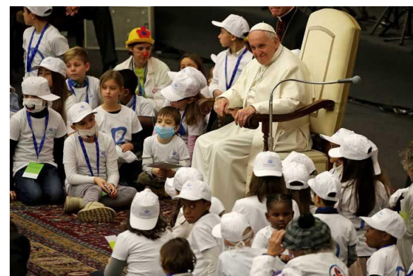
Pope Francis leads a special audience in Paul VI hall at the Vatican for patients and workers of Rome's Bambino Gesù children's hospital.