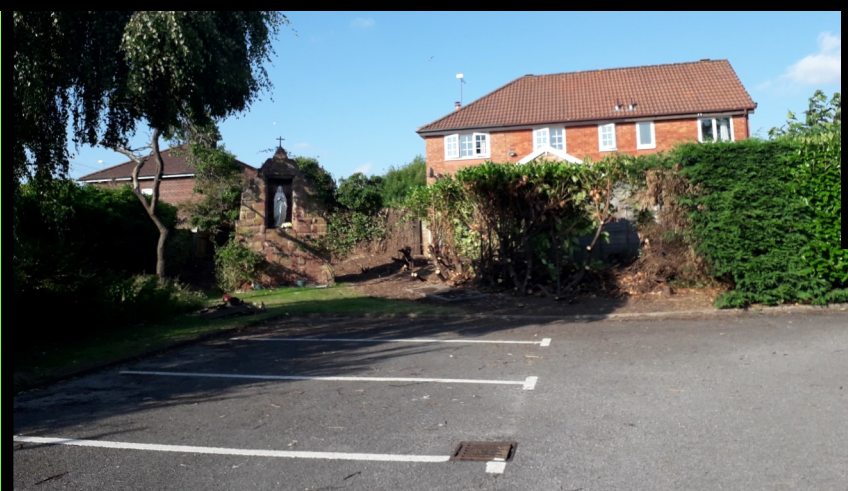
Re-landscaping area around the Marian shrine