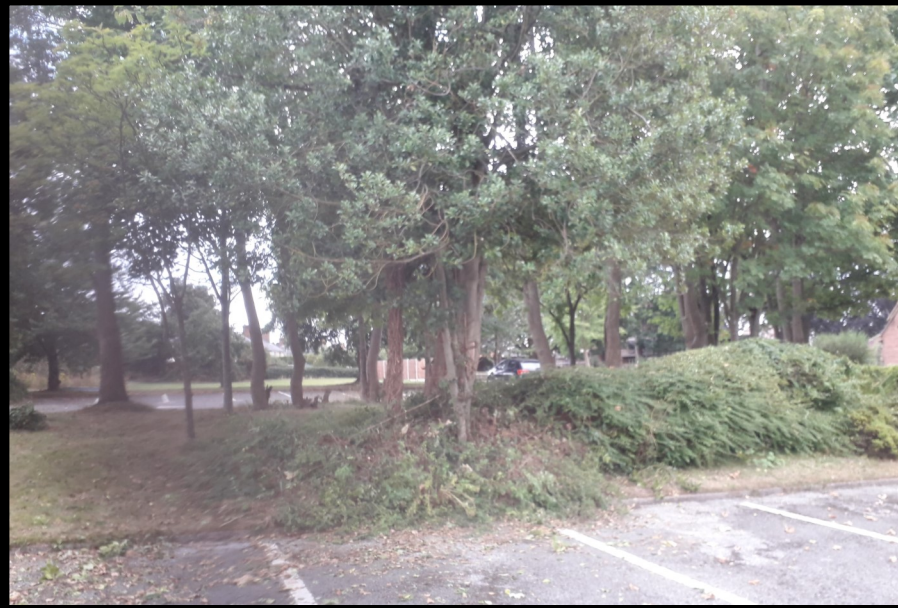
Clearing the island of over-growth and getting ready for planting