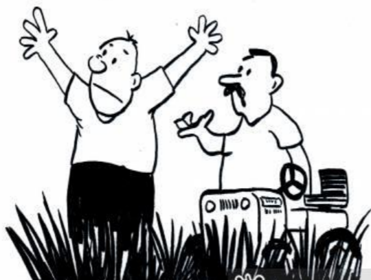
Parting the Red Sea and the Church Lawn are not exactly the same!